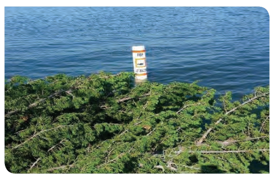
According to research, when submerged, trees will attract schools of prey fish within 24 hours and predatory fish within 48 hours.

All Sealite Regulatory Buoys utilize USCG approved retroreflective graphics for highly visible and important navigation information. Stabilizing compounds added to the polyethylene help protect the buoys against degrading effects of UV exposure. Toxic chemicals or heavy metals are never used in the production of the buoys. Uniform thickness, resulting from Sealite's rotational molding production process, produces buoys with exceptional strength, durability and service life. The Sealite Buoys are exceptional value for federal and state agencies, local municipalities and law enforcement agencies who have the responsibility for public safety on the water.