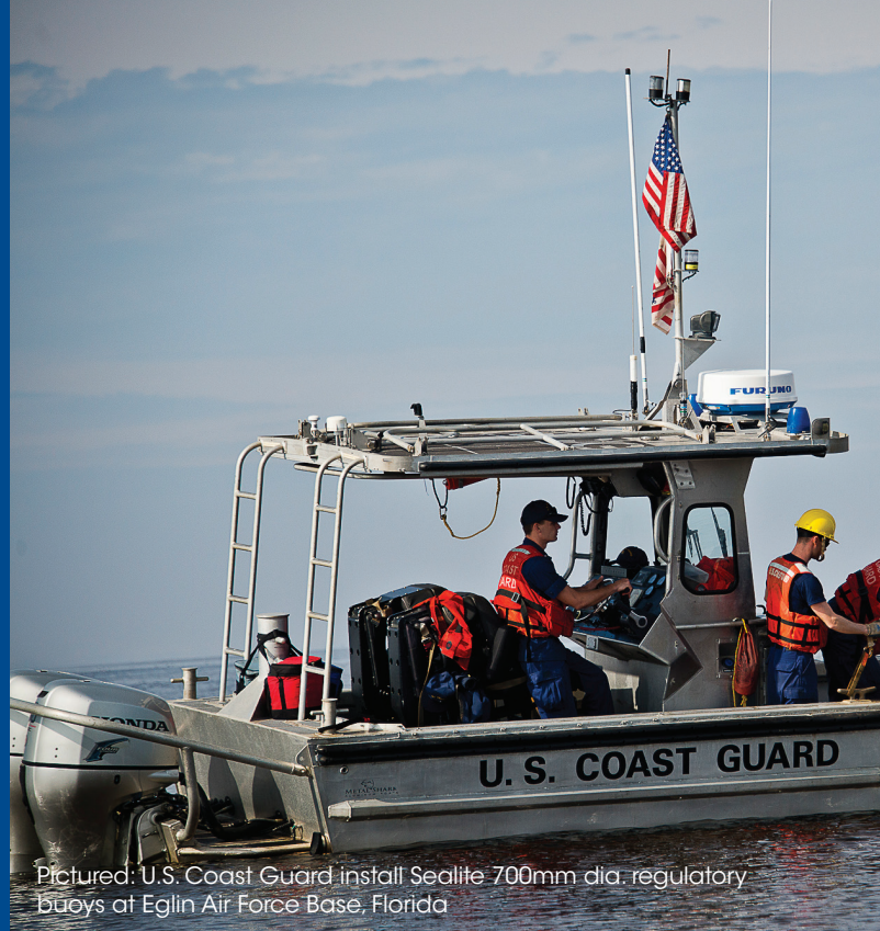
Pictured: U.S. Coast Guard install Sealite 700mm dia. regulatory buoys at Eglin Air Force Base, Florida